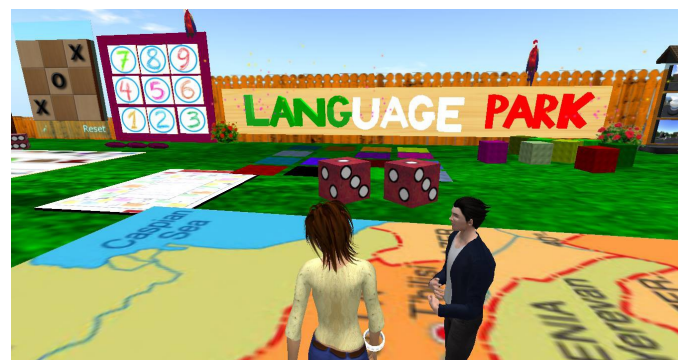
Figure 2. Language Park in Second Life

Another game-like activity in the context of foreign language learning came out as a result of teaching Italian to Turkish learners. The small project was named “Language Park” where a platform was specifically developed for language learning through gamification and in particular to the learning and exchange of Italian language. Through gaming activities, International (Turkish – Italian) tandem exchanges, role plays in virtual settings (holodeck), web quests and “walking and talking” virtual tours were organized. This has given us the opportunity to creatively rethink and experiment with a different and informal idea of Italian Language Education.