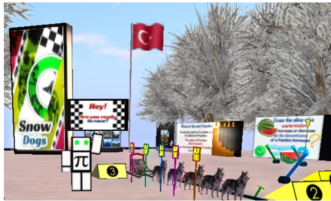
Figure 4. Snow Dog Game in Second Life

using virtual learning environment. Fractions are notoriously difficult for students to learn and for teachers to teach. Most of the students in elementary school have lack of understanding in comparing fractions and fraction operations.