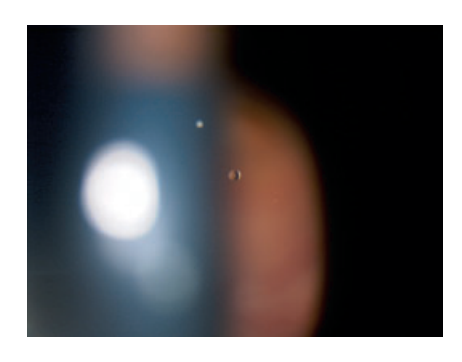
Fig. 1. Slit-lamp biomicroscopy demonstrating three oily droplets in the mid-vitreous cavity.

Of 22 eyes injected intravitreally with pegaptanib between October 2007 and April 2008, three were observed to contain presumed intravitreal silicone oil droplets. The droplets were firstly noticed occasionally during routine ophthalmological examination in one patient's eye. Consequently, we undertook a careful examination of all pegaptanib-injected patients and we found intravitreal oily droplets in two eyes of two other patients. None of the three patients with intravitreal oily droplets complained of floaters in their visual fields. The intravitreal droplets were small, spherical, translucent foreign bodies. Under biomicroscopic examination, the droplets resembled silicone