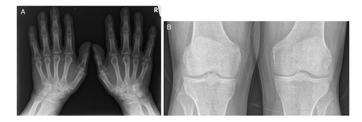
Fig. 2. A) Frontal radiograph of the hands showed no significant joint narrowing and no erosive changes. B) Frontal radiograph of the knees showed mild medial tibiofemoral joint space narrowing and minimal osteophytes.

Symmetrical wrist involvement and presence of nodules, initially led us to diagnose him as seropositive RA. Initial blood tests results were as follows; white blood cells (WBCs) count: 11,400 cells/mcL, hemoglobin: 15.7 d/dL, platelet count: 245,000 cells/mcL, creatinine: 0.9 mg/dl, alanine transaminase (ALT): 53 U/L, aspartate transaminase (AST): 31U/L, erythrocyte sedimentation rate (ESR): 20 mm/h and C-reactive protein (CRP): 12.1 mg/dl (N: 0-5). Anti–cyclic citrullinated peptide (CCP) and rheumatoid factor (RF) were negative. The x-rays of the hands were unremarkable and knee radiographs showed mild degenerative changes (figure 2).