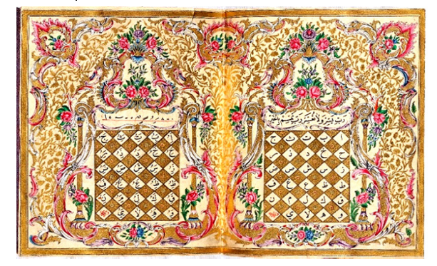
Pic.3 Alphabet Number A6519

Alphabet Number A 6519; Nineteenth century, Istanbul, Ottoman period. 34 folios in naskh, 1 double folio illuminated alphabet page, illuminated margins, gold decorated purple binding with a flap.12.2x16x04 cm. (Uluç, 2015:71).