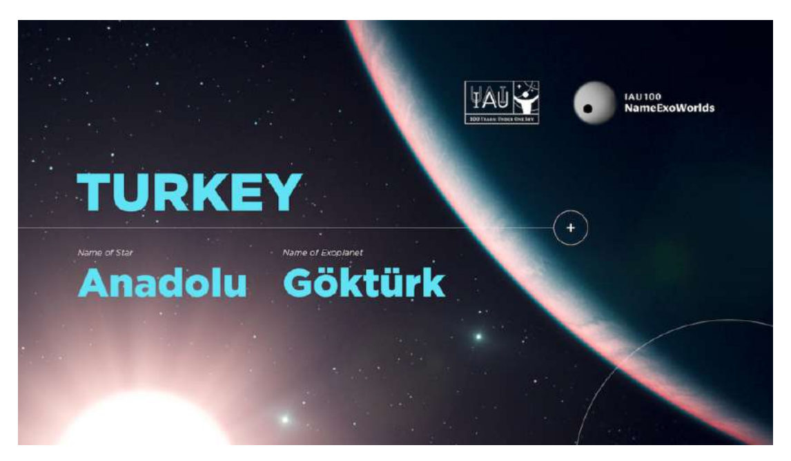
Figure 4: Result of the IAU 100-NameExoWorlds campaign for Turkey. Anadolu and Göktürk were selected as the proper names for WASP-52 and its planet, respectively.

IAU had organized an exoplanet naming campaign in 2015 to name 19 planets. Taking the opportunity to celebrate it's 100th anniversary, IAU launched another version of NameExoWorlds campaign which almost 100 countries have participated. Each country supposed to name an exoplanet and the host star which revolves around it. WASP-52 in the constellation Pegasus assigned to Turkey together with it's planet WASP-52b.