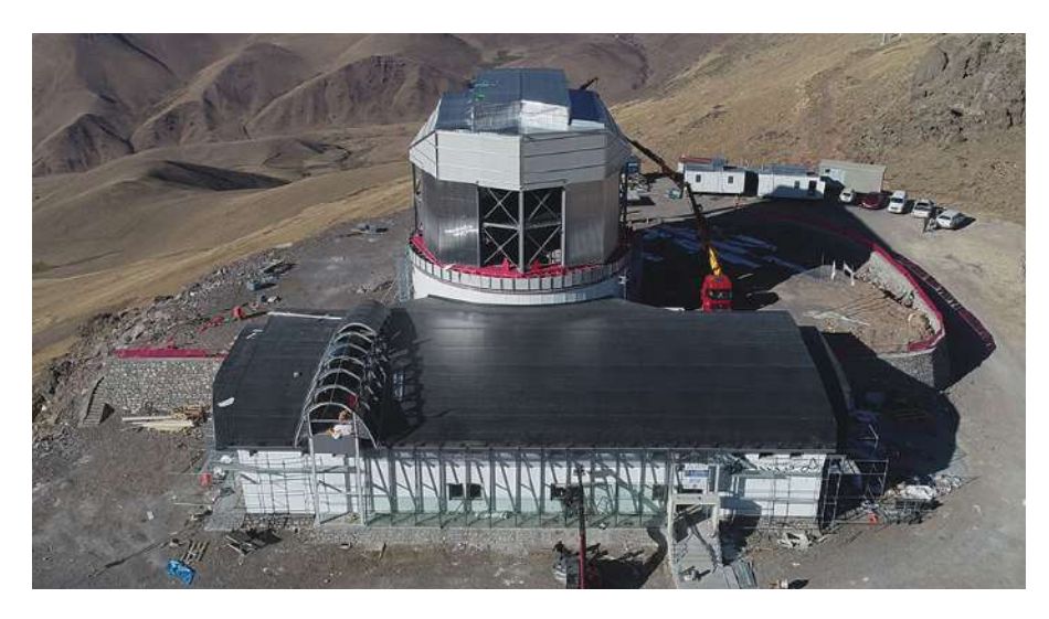
Figure 10: Status of the Eastern Anatolia Observatory (DAG) as of November 2019.

DAG telescope has been manufactured completely in the relevant AMOS^8 and EIE workshops, dissembled and ready for the transportation to the observatory site in 2020. Following the completion of the enclosure in summer 2020, assembling of the telescope will be started. In the meantime, telescope's M2 and M3 mirrors are ready and packed for the transportation, whereas M1 mirror is in the stage of final coating which will be ended in June 2021.