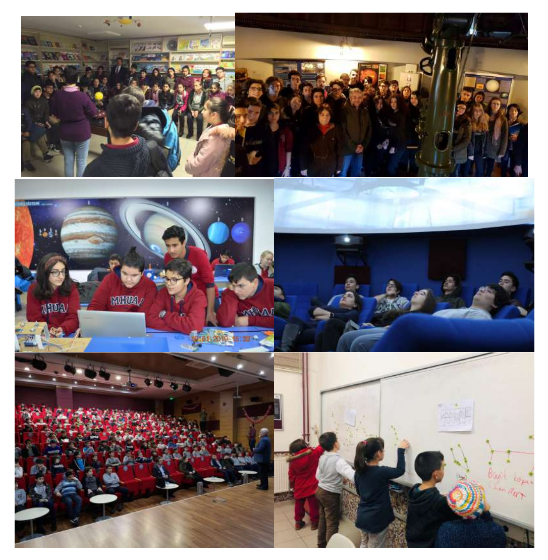
Figure 3: Some photos taken during the 100 Hours of Astronomy events.