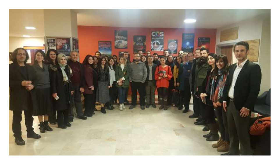
Figure 8: Teacher training program organized by Istanbul Branch of Ministry of Education together with Istanbul University, Department of Astronomy and Space Sciences.

Figure 7: Sample teacher training events that have been organized by AstroBilgi, Turkish Astronomical Society's Public Outreach Commission. Examples here for the events in the cities Düzce, Kars, and Kahramanmaraş, respectively.