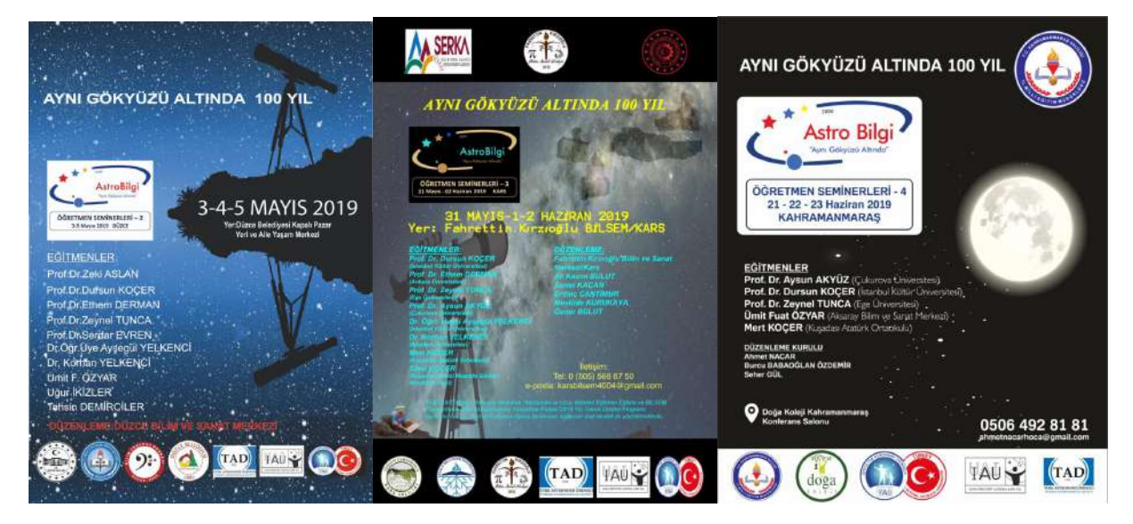
Figure 7: Sample teacher training events that have been organized by AstroBilgi, Turkish Astronomical Society's Public Outreach Commission. Examples here for the events in the cities Düzce, Kars, and Kahramanmaraş, respectively.