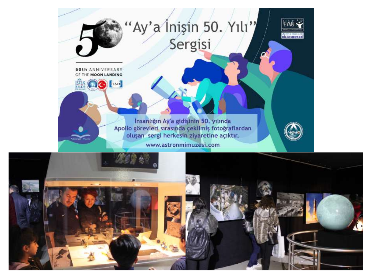
Figure 5: Exhibition organized by ISTEK Belde Schools Astronomy Museum for the 50th anniversary of the Moon Landing.