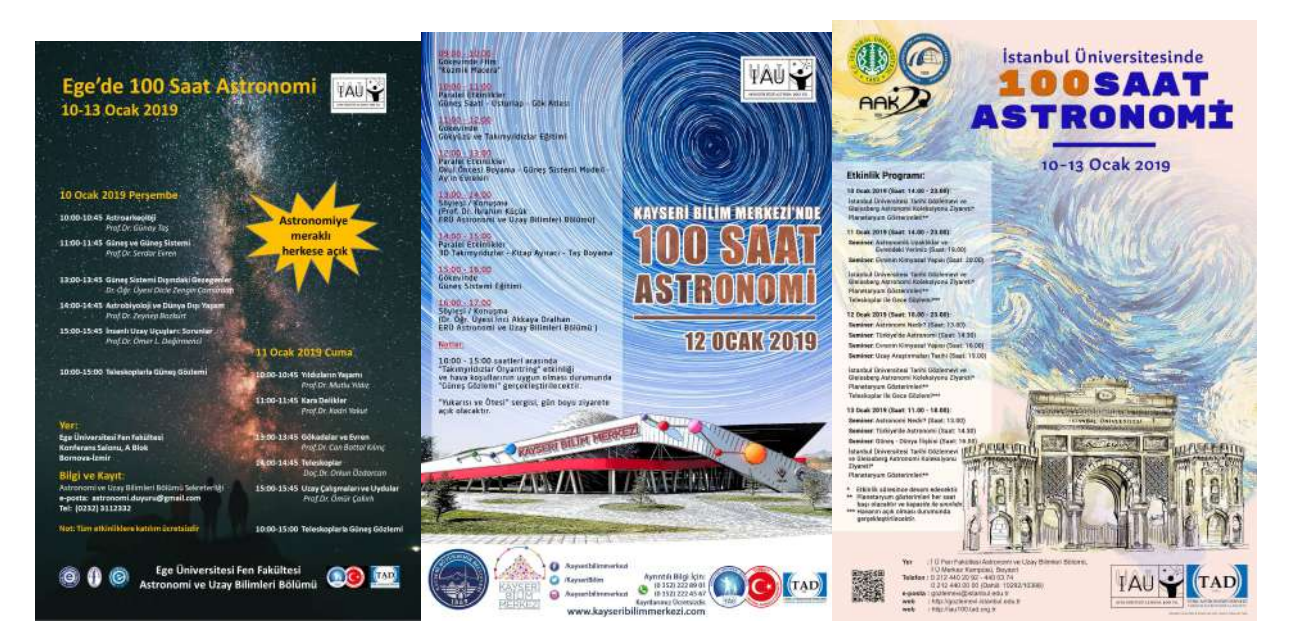
Figure 2: Sample of 100 Hours of Astronomy event posters. From left to right; events organized by Ege, Erciyes and Istanbul Universities, respectively.