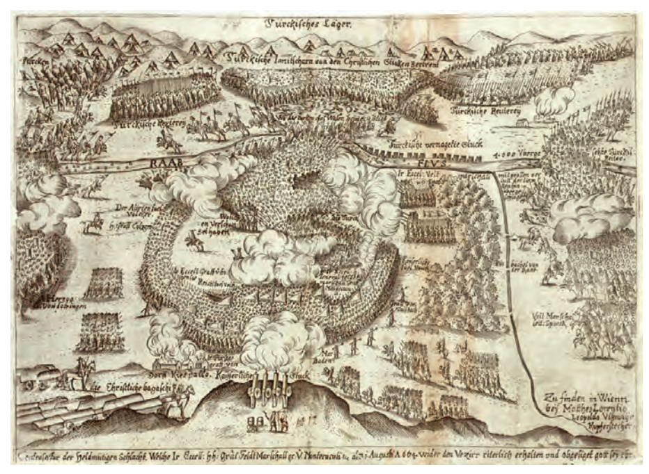
Fig. 1. The battle of St. Gotthard, 1st August 1664. Engraving of M. L. L. Ultzmayer

this reason, one must be prepared to delve into the complexities of official documents and give meaning to figures randomly appearing in contemporary accounts. This alone, however, does not overcome the complication. The archival sources on the Ottoman field army of 1663-64 are, so to speak, very unwilling to cover all the military units of the Ottoman army at a given time offering instead glimpses of randomly exposed units on different occasions. Taking such hardships into account, a descriptive picture of the Ottoman fighting forces can surface by critically juxtaposing and aligning all relevant and surviving material.