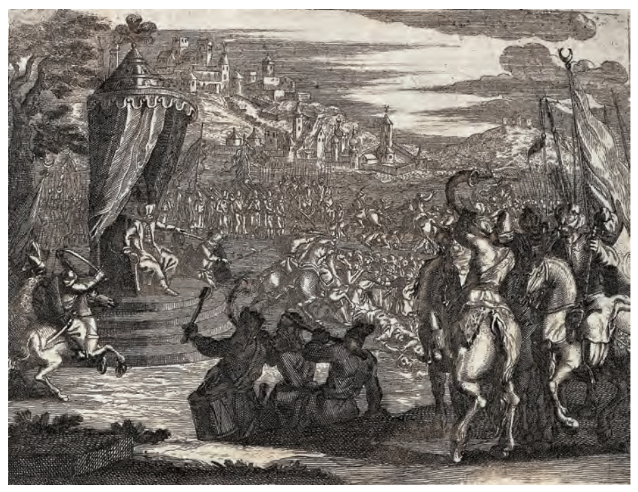
Fig. 3. Turkish camp during the campaign of 1663 in Hungary. Engraving from Paul Rycaut's work on the Ottoman Empire (1694)

contribution, certain names brought forward by contemporary accounts will prove useful.