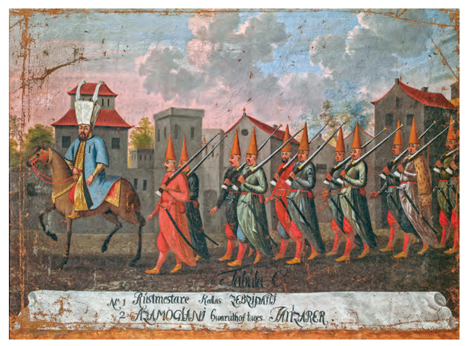
Fig. 2. Azamoglans with guns in Sultan Mehmed IV's entourage. Painting of Claes Rålamb (1657)

book indicates there were over 600 armorers active in the campaigning year of 1663, roughly supplementing the overall number to 10.0008.