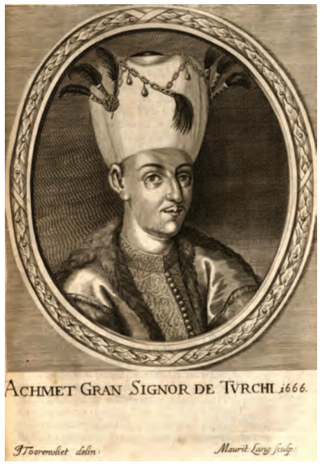
Fig. 4. Portrait of the Grand Vizir Fazil Ahmed pasha in Priorato's book entitled Historia di Leopoldo Cesare (1670)

knowing the army's firepower capacity was a decisive factor in early modern warfare.