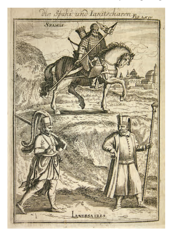
Fig. 5. Sipahis and janissaries. Engraving of Alain Manesson Mallet (1683)

According to the imperial budget of 1661, 15.248 cavalry soldiers in the so-called six regiments of the kapıkulu corps received pay from the Ottoman treasury<sup>32</sup>. However, it is not certain to what degree these cavalry units were mobilized in the Ottoman-Habsburg war of the ensuing years. The aforementioned anonymous eyewitness claims to have seen 12.000 sipahis around the fortress of Érsekújvár in the autumn of 1663<sup>33</sup>. Ottoman sources, on the other hand, remain interestingly silent on the matter. The only clear reference discovered thus far is a financial entry computing the salary of a