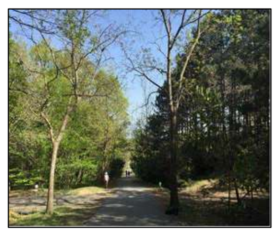
Figure 1: The oak plot on the left and the pine plot on the right in Atatürk Arboretum-Belgrad Forest

Pinus nigra Arn. subsp. pallasiana (Lamb.) Holmboe and Quercus petraea (Matt.) Liebl were selected as representatives of needle and braod-leaved tree species, respectively (Figure 1). The oak stand was natural while pine stand was plantation. The study period covered the first month of the growing season (01.04.2016-30.04.2016). Six trees in both plots were selected as sample trees according to the quantil of total method (Cermak et al, 2004). Leaf area index (LAI) of the plots were 0.58 for pine and 0.54 for oak. The area of the pine plot was 800 m-2 while the oak plot was 1300 m-2.