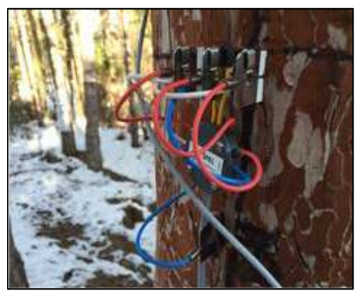
Figure 2: EMS 81 Sap flow system with electrodes and thermosensors on a tree trunk

After installation of the sensors, tree trunks were packed with polyuretan foams against direct heat of the sun and heat isolation. The data were evaluated by EMS Mini32 and Microsoft EXCEL softwares.