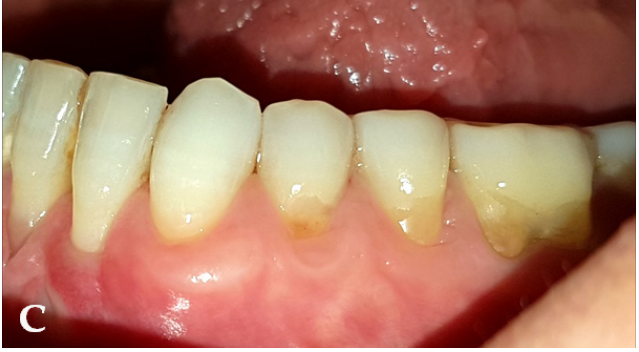
Figure 2 : Results of treatment of multiple recession-type defects with connective tissue graft on the left mandibular site of the patient. A: Preoperative view of gingival recessions; B: 6 months after surgery; C: 36 months after surgery.